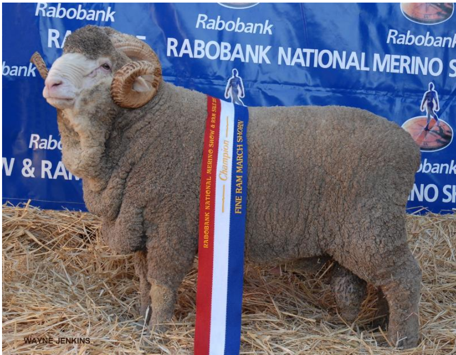
N10 WHO WAS JUDGED CHAMPION FINE WOOL MARCH SHORN RAM AT THE DUBBO NATIONAL SHOW 2007

The latest information on Nerstane Merino Stud's Proven Results and Performance